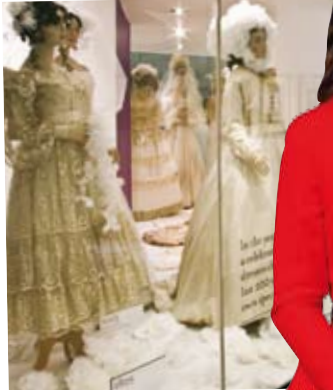
Combine tea, cake and marriage

For a full travel guide on the United Kingdom go to intmagazine.com