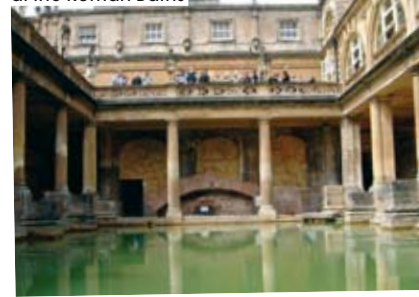
Discover the city's history at the Roman Baths

up with a foot spa – the Romans who built this city certainly knew what they were doing. By now, for me anyway, it seems as if London doesn't exist.